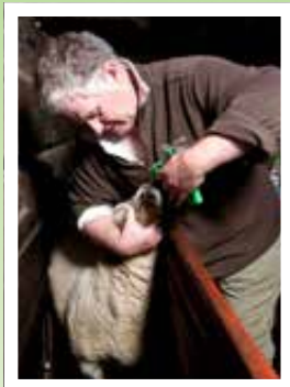
Fig 1 - Note position of the knees

With the gun in your favoured hand, approach the first sheep from outside of the race. Standing with your knees facing the race side, make sure your knees are in line with the animal's neck and shoulder.